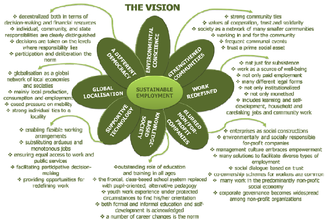
Figure 1: An overview of the vision of sustainable employment in 2050 2

the opportunity to envision “the future we want in the world of work in 2050”, they constructed surprisingly similar answers. As the vision covered a wide array of topics that is beyond the scope of this brief, the following figure provides an overview of this vision.